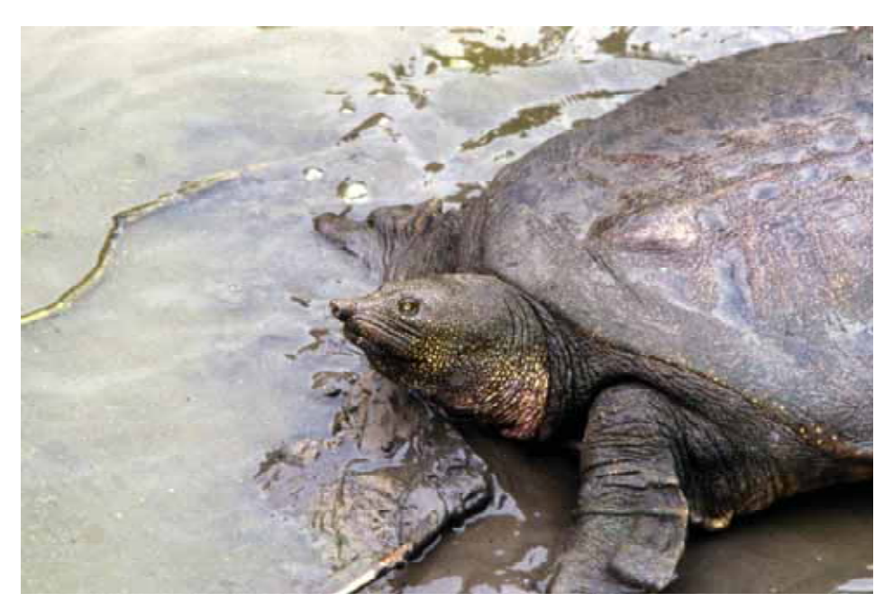
Fig. 2. Nile Soft-shelled Turtle, Trionyx triunguis, at Nahar Aleander, Israel.

using individuals from one of the main sites of occurrence (KASPAREK & KINZELBACH 1991) as a source.