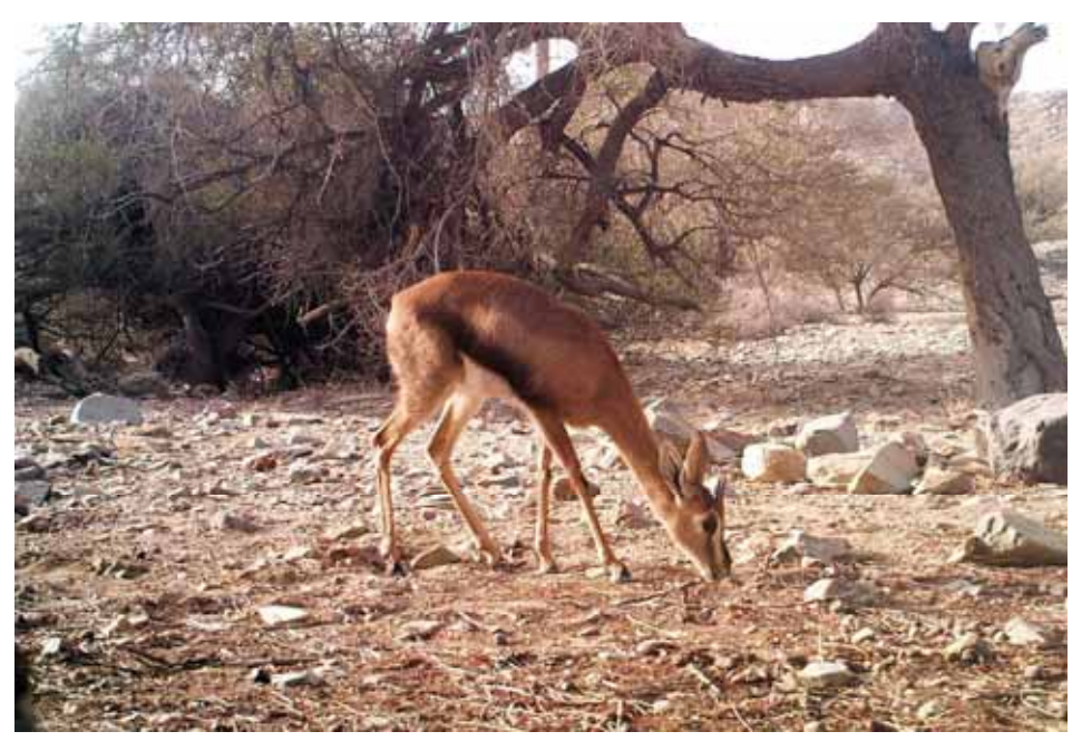
Fig. 4. Young-adult male Arabian Gazelle captured on 9 January, 2011 in Wadi Atlah, Wadi Tarj Proposed Protected Area in the Asir Mountains of south-western Saudi Arabia. Note that the animal is feeding on the fallen pods/flowers of Acacia asak .