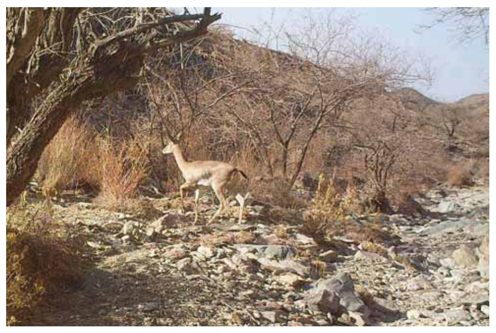
Fig. 3. Adult female Arabian Gazelle captured on 26 February, 2011 in Wadi Atlah, Wadi Tarj Proposed Protected Area in the Asir Mountains of south-western Saudi Arabia. Note the extremely dry vegetation typical for the mountains and foothills of the western Asir.