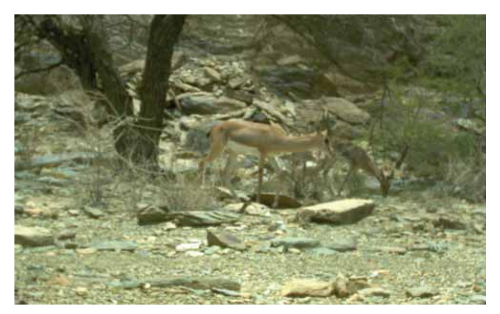
Fig. 2. Adult male and adult female Arabian Gazelle captured on 4 August, 2011 in Wadi Saleb, Wadi Tarj Proposed Protected Area in the Asir Mountains of south-western Saudi Arabia.