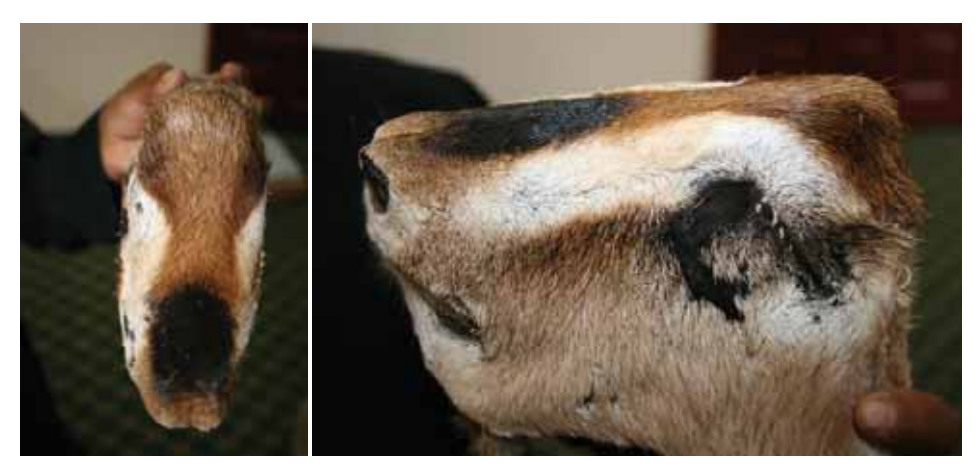
Fig. 5. Provisionally stuffed Arabian Gazelle head (A front view, B lateral view), hunted in Wadi Tarj Proposed Protected Area in the Asir Mountains of south-western Saudi Arabia. Note the prominent black nose spot and the bright buff-brown body colour with a greyish tint.

morphometric analysis of skull and horns as well as phenotypic differences, cladistic analyses never associate the two taxa (GROVES 1996). The pelage colour of G. arabica cora is very variable, but always some shade of buff. The face-markings and flank stripe are generally well expressed, and the face-markings always show a broad, smudgy black nose spot. By contrast, G. erlangeri is described as much smaller and with a much darker body colour of dark grey-brown, even tending towards blackish in some individuals. The dark flank band and the face pattern are well developed. The forehead and mid-face are dull buff-brown. The images obtained during our study show clearly a reddish to bufy-brown pelage colour, with a dark flank band and well developed black nose spot, suggesting that the taxon encountered in Wadi Tarj refers to G. arabica cora rather than to G. erlangeri . Photographs (Fig. 5a-b) taken from stuffed gazelles hunted in the same area as those in this camera trapping study gave a similar impression. A dark black nose spot and flank stripe are prominent and, and the body colour is bright buff-brown rather than dark grey-brown.