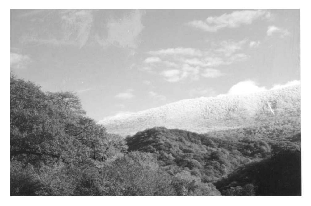
Fig. 2. View of Golestan National Park in the Caspian Region.