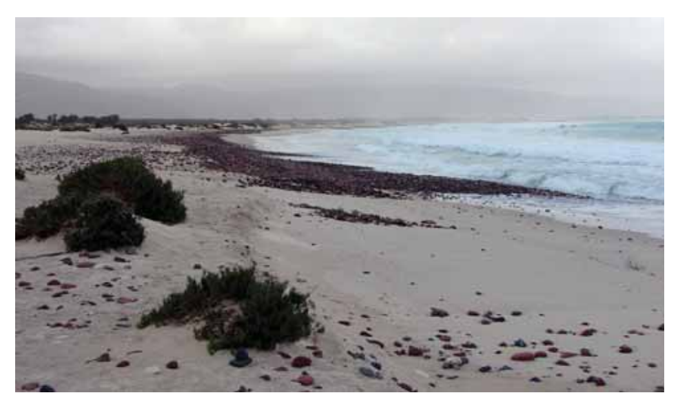
Fig. 4. The Arabian Peninsula is surrounded by seas which is home to rare and endangered habitats for wild-life (photograph: Max KASPAREK).