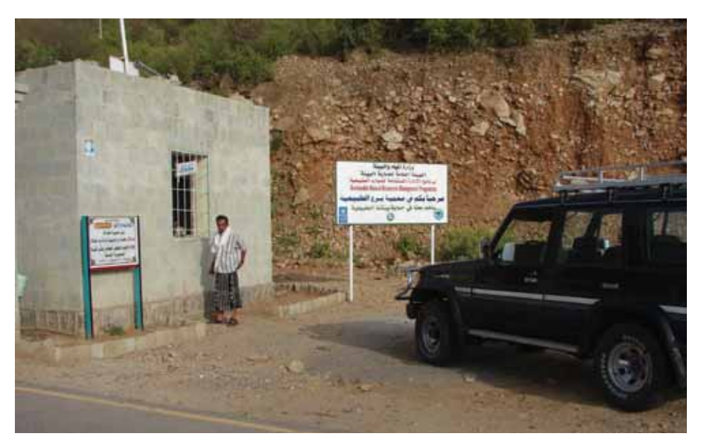
Fig. 3. Entrance to the Jebal Bura'a Protected Area in Jemen, one of the few remaining forest areas in the Arabian Peninsula (photograph: Max KASPAREK).

One of the most promising ways for protected areas to generate tangible and sustainable benefits is from nature-based tourism.